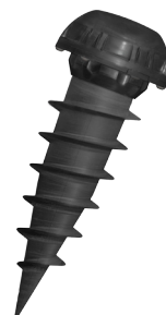
RDC Seismic Sensor Node