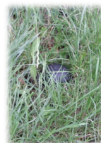
Covert seismic sensor: screw design (for minimal spoil) and discreet radio antenna