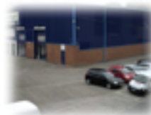
Peripheral protection of buildings