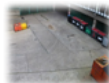
Protection of sensitive areas