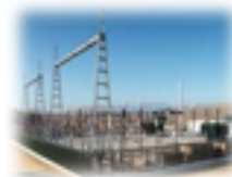
Perimeter protection of high-security facilities